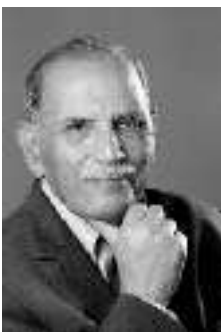
Dr. F C Kohli

Former Deputy Chairman Tata Consultancy Services Ltd. (1994-1995)