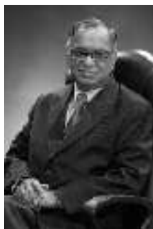
Dr. N. R. Narayana Murthy

Former Deputy Chairman Tata Consultancy Services Ltd. (1994-1995)