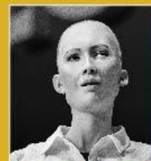
Sofia the Robot Hanson Robotics