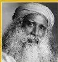
Jaggi Vasudev Isha Foundation