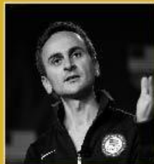
Mounir Zok U.S. Olympic Committee