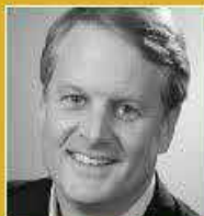
John Donahoe eBay / PayPal