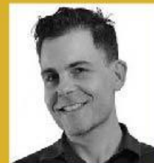
Dr David Hanson Hanson Robotics