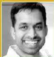
Pallela Gopichand Indian Badminton Coach