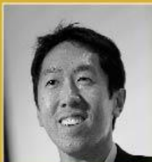
Andrew Ng Coursera